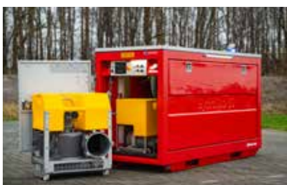
HydroSub® 60 with FloodPump