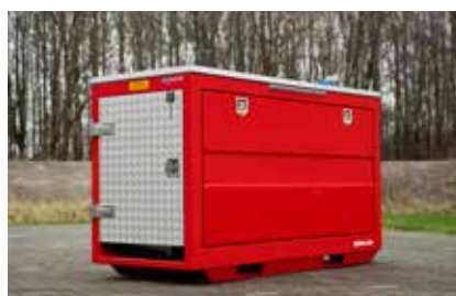
HydroSub® 60 skid version