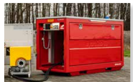
HydroSub 60® with standard submersible pump